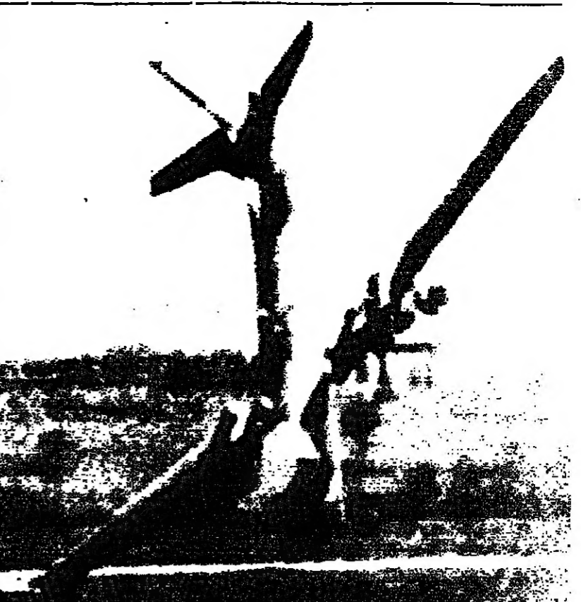
A SPLIT SECOND BEFORE THE CRASH: Its nose centimetres from the ground, this twin-engined Andover of the Royal Air Force was photographed just before crashing after take-off from the airport at Siena, Italy. Four British paratroopers were killed, four injured and eight others escaped unhurt.

The "Los Angeles Times" contrasted this new aggressiveness with the mood of the past few years, during which there was a general tendency to forgo conversion efforts, an acceptance of Judaism and an emphasis on "raising evangelic social consciousness on such issues as race and poverty." It noted that the Vatican and the World Council of Churches had led an "attempt to erase traces of anti-Semitism," but that in the late sixties, there were changes of attitude along with the "less-than-hoped-for moral support" during and after the Six Day War.